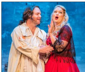
A scene from Tosca

Opera comes to Somerset this July with glorious works by Puccini and Rossini. In partnership with Project Factory CIC, Opera Brava, Britain's leading outdoor touring opera company, is bringing Tosca and The Barber of Seville to the beautiful grounds of The Bishops Palace in Wells.