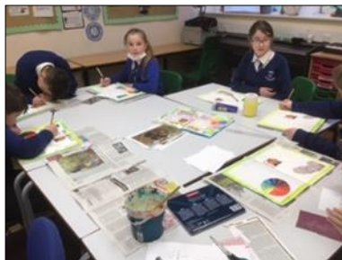
Project on Chocolate – Frida Kahlo Art