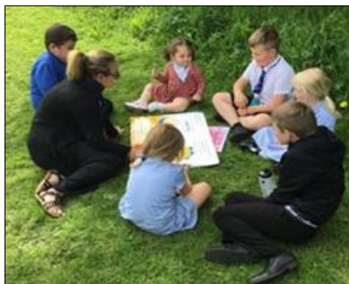
Yrs5/6 reading to Nursery/Hedgehogs

Our Project this term is 'Coasts'. We are looking forward to a visit to the seaside!