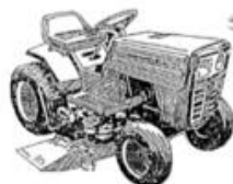
RIDE ON MOWERS