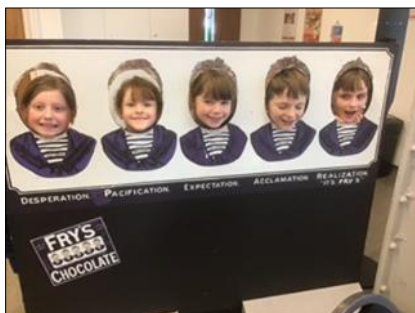
Visiting The M Shed in Bristol