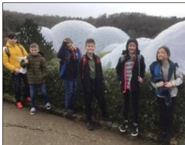
Visiting the Eden Project