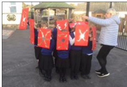
Horrible Histories Project

Like most primary schools in the area, we experienced lots of absence with Covid at the end of the Autumn and throughout the Spring term. In spite of this, we have managed to complete lots of project work and extra- curricular activities. Here are a few for you to see: