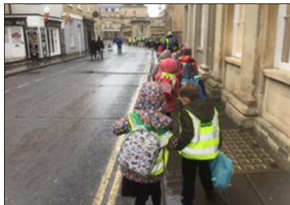
Panto trip to The Theatre Royal, Bath