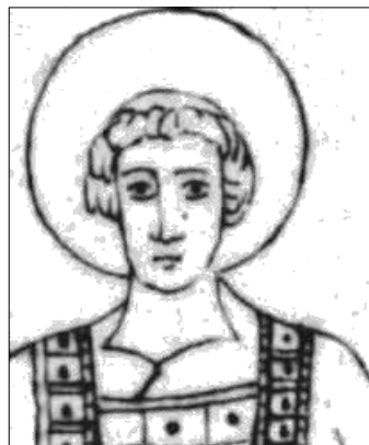
Robert, Count of Mortain

In 1479 there was still 21 Tenements, but held now by 15 Tenants at Benhayes, Cleave Hill, Howley, Copse, Pyle, Brownsey, Woodhayes, Nash Ford and Northay.