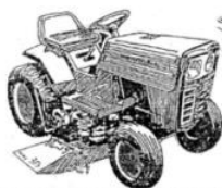
RIDE ON MOWERS