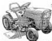
RIDE ON MOWERS