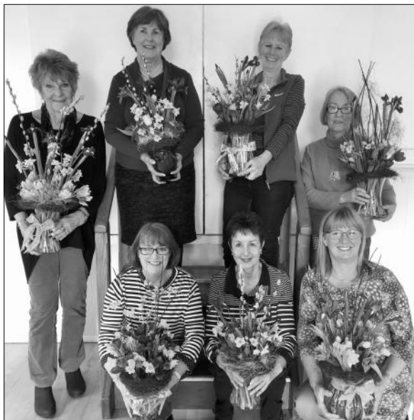
Happy ladies with their Spring flowers