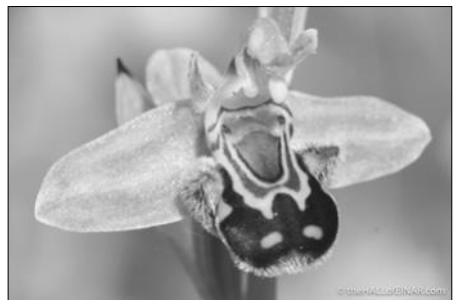
Look out for bee orchids from June to July

Park in Bishopswood village and walk down past village hall. Lane off road at ST 252 129, 400 metres from Bishopswood village.