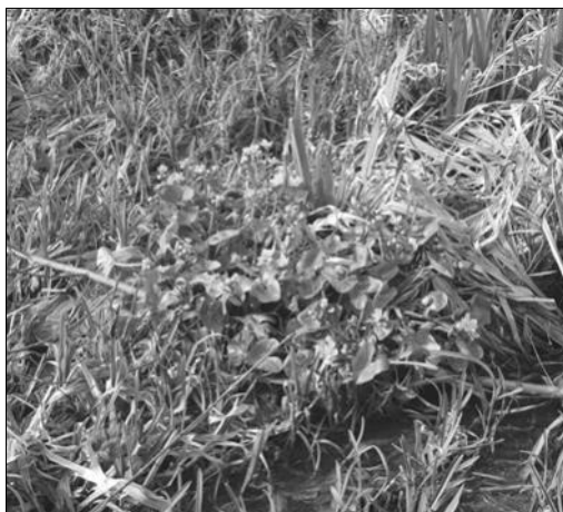
Marsh Marigolds are flowering by the pond

I hope you enjoyed seeing the splendid display of snowdrops in the woodland and near the Symes' gate during February. Primroses and Celandines are out now around Gerry's bench and on the mound and the Marsh marigolds are making a nice splash of colour in the pond. Do watch out for the bluebells that are coming up in the woodland and should be in bloom during April and May. All of these flowers are welcomed by bees and butterflies, some of which have already been seen on the wing in the few warm days in late February.